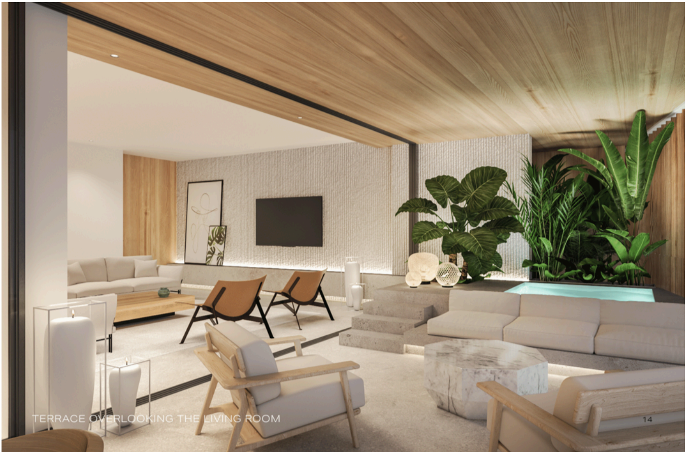
TERRACE OVERLOOKING THE LIVING ROOM