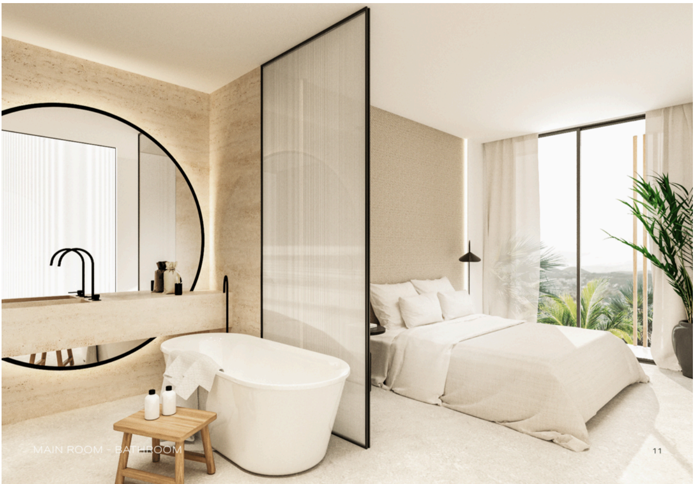
MAIN ROOM - BATHROOM