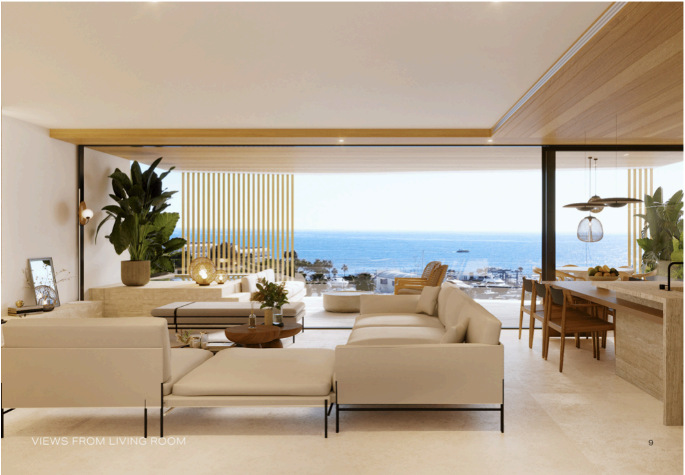
VIEWS FROM LIVING ROOM