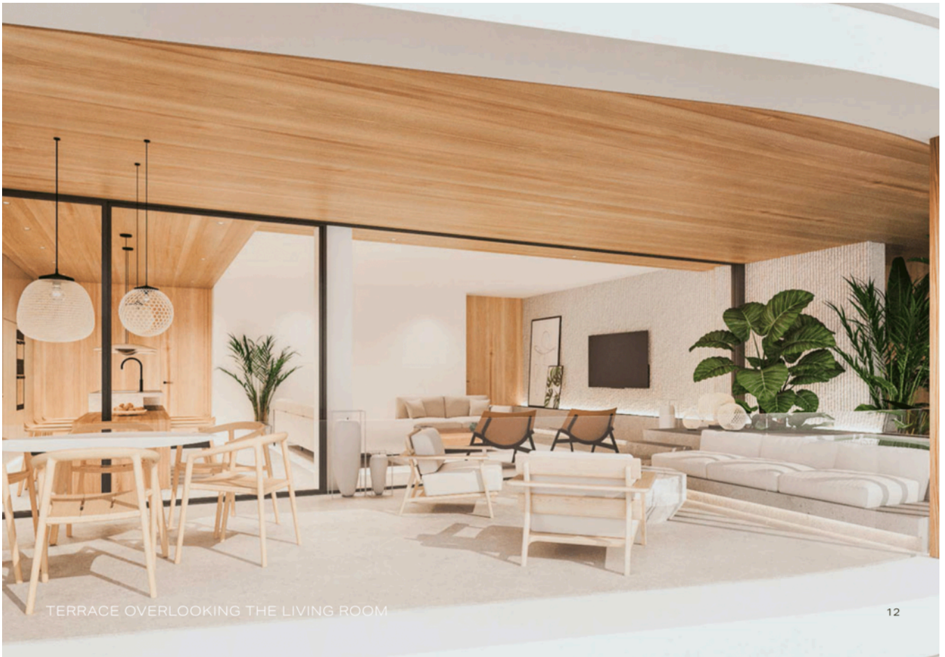
TERRACE OVERLOOKING THE LIVING ROOM