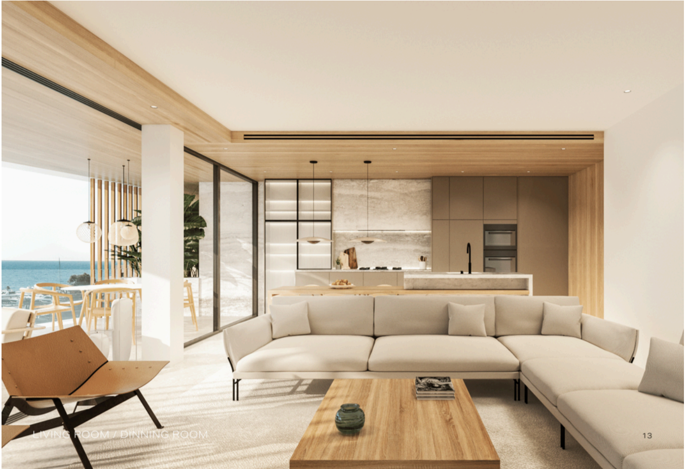
LIVING ROOM / DINNING ROOM