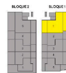
ESQUEMA PLANTA BAJA