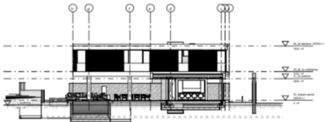
3 doorsnede 3 0,000000