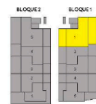
ESQUEMA PLANTA BAJA