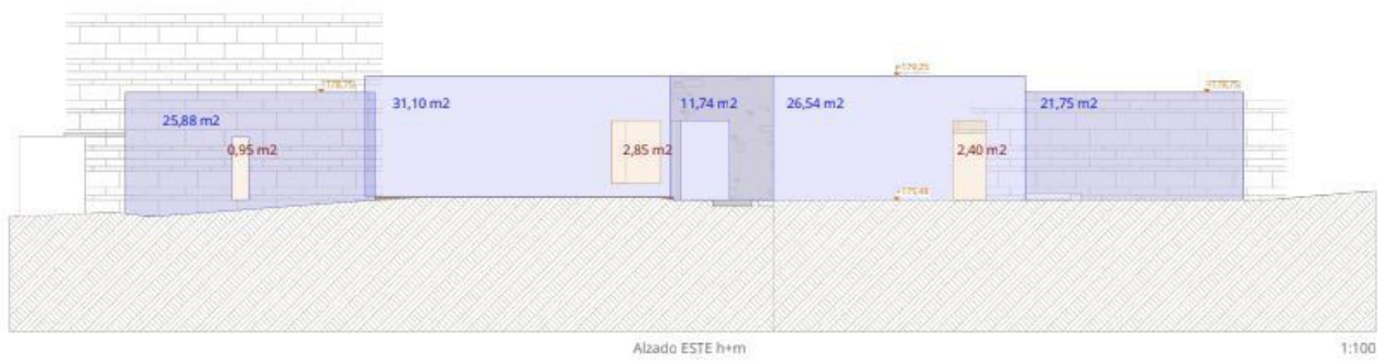
Alzado ESTE h+m