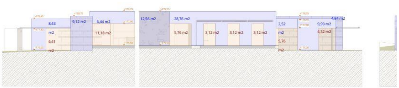
Alzado OESTE 1